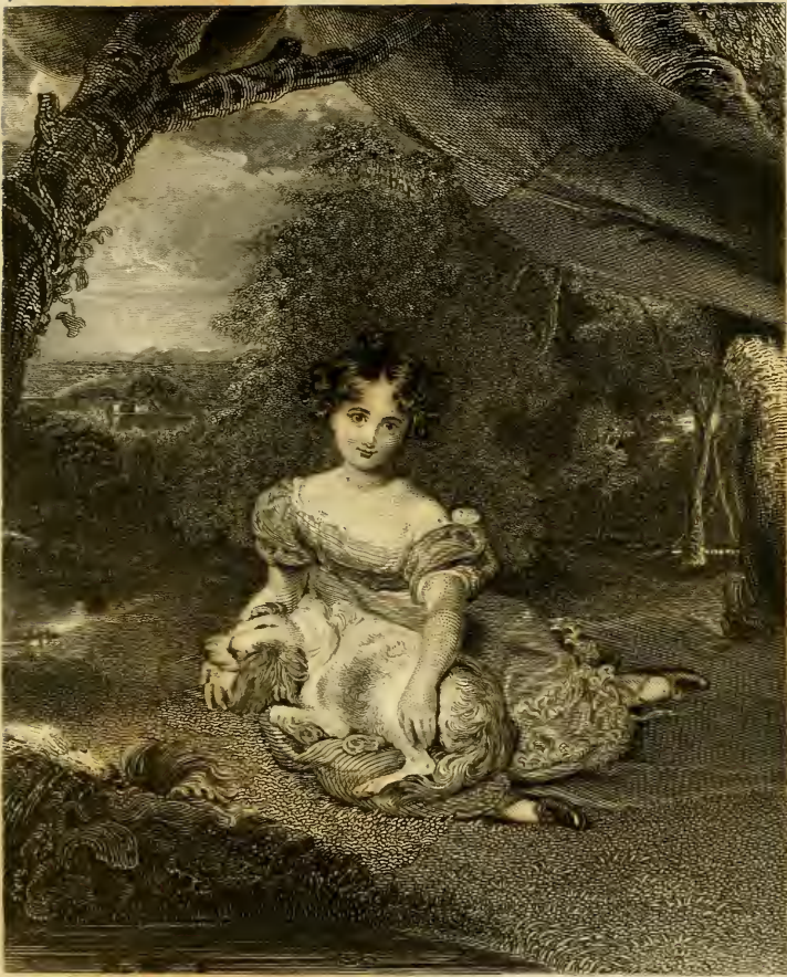
THE LOST DARLING